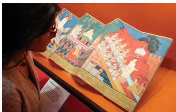
Life of the Buddha, Burma 19 th Century

In February Members of the Theravada and Zen groups travelled to lunch in London together followed by a visit to the Buddhism Exhibition at the British Library. An enormous screen animation greeted visitors at the entrance. The curation also allowed close examination of finer details.