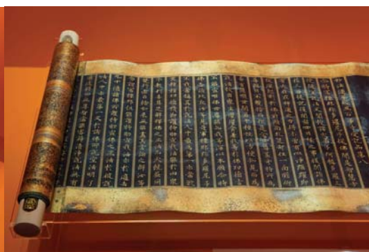
Lotus Sutra, Japan 1636

As one would expect at the British Library there was an emphasis on text in the exhibits. There was also acknowledgement of experiential understanding in the soundscape throughout the exhibition accompanying the visit with flowing water and birdsong.