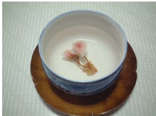
Preserved cherry blossom and sakurayu tea

In Japan, cherry blossoms symbolise clouds due to their nature of blooming en masse . Their transience also means they are seen as a metaphor for the ephemeral nature of life often associated with the Buddhist notion of impermanence.